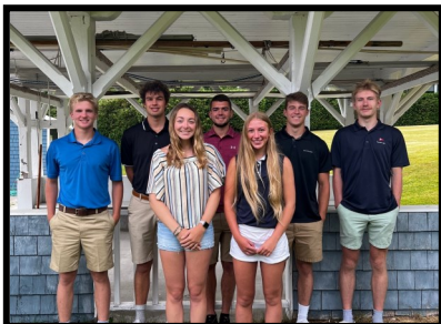
Our 2022 Belvedere Scholarship Recipients!