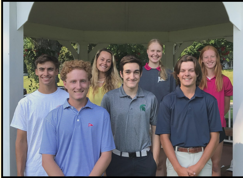
2021 Scholarship Recipients