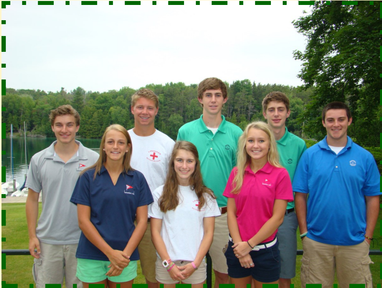
2015 Scholarship Recipients